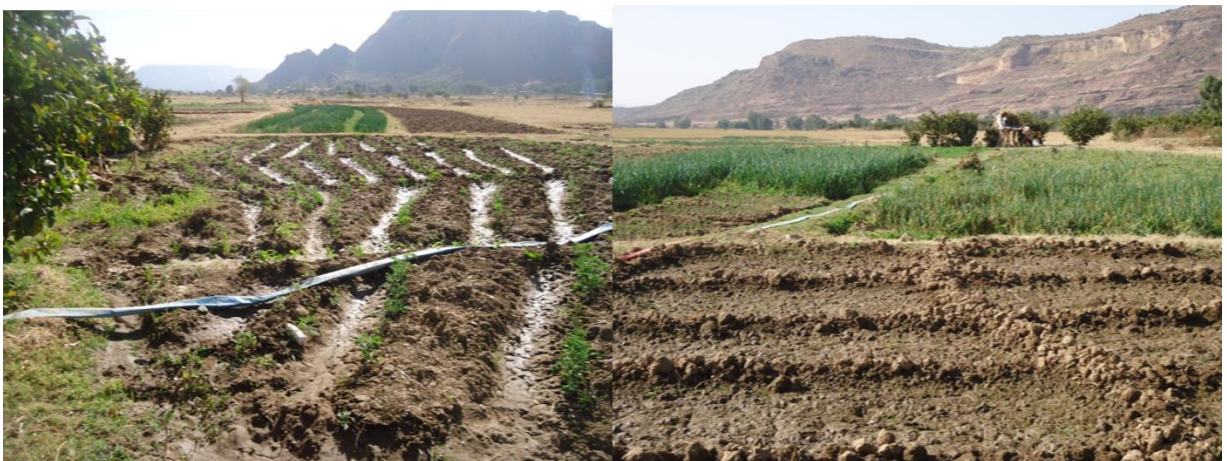
Appendix 2.3 expansion of irrigation land due to the implementation of SWC technologies