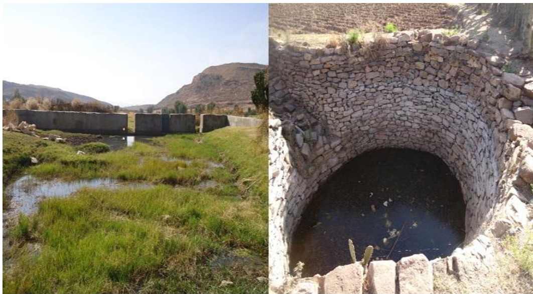
Figure 4 water sources after implementation of SWC

According to focus group discussants, the problem of water scarcity was worse before the implementation of the physical infrastructure which significantly impairs crop production and causes food insecurity. During that time almost none of the farmers had irrigation access which currently increased to 86 % (Table.5). Besides irrigation, the water is also used for drinking purposes and the increased access to water reduces the distance women travel to fetch water.