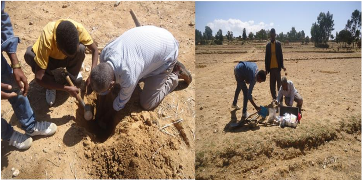
Appendix 2.1 Soil sample should be taken