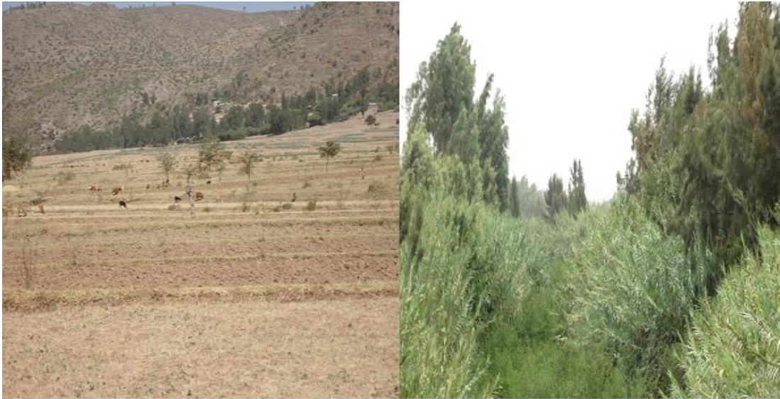
Figure 3 physical and biological conservation practices in the study area