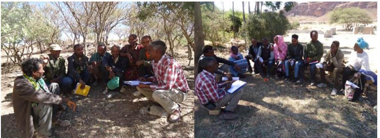
Appendix 2.2 desiccation with focus group (FGD) and key informants